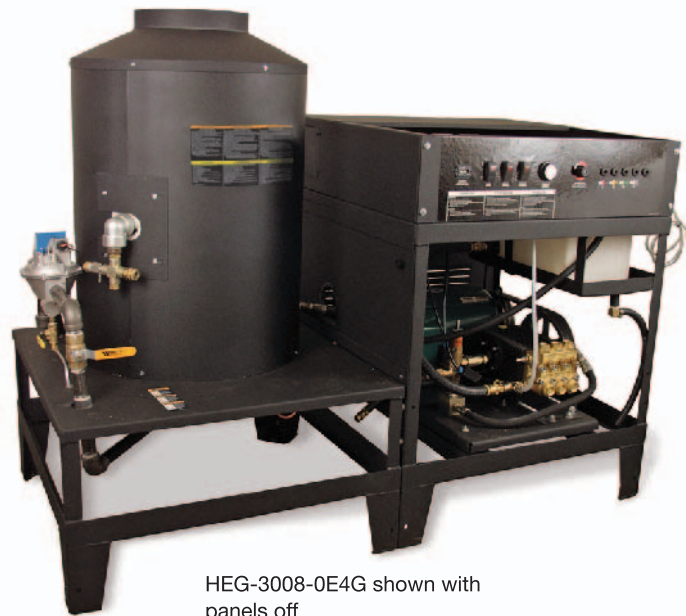
HEG-3008-0E4G shown with panels off

12-inch draft diverter included (24-inch height)