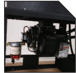
Beckett burner with fuel/water separator