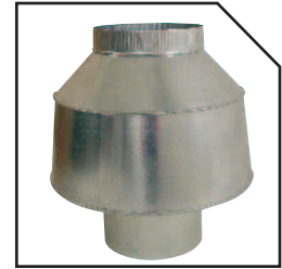
10-inch draft diverter included (21-inch height)