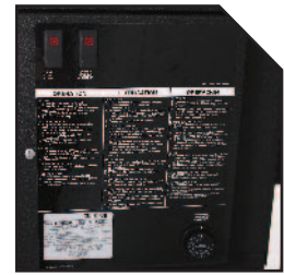
Control panel shown with On/Off burner switch, On/Off pump/motor switch, and adjustable thermostat