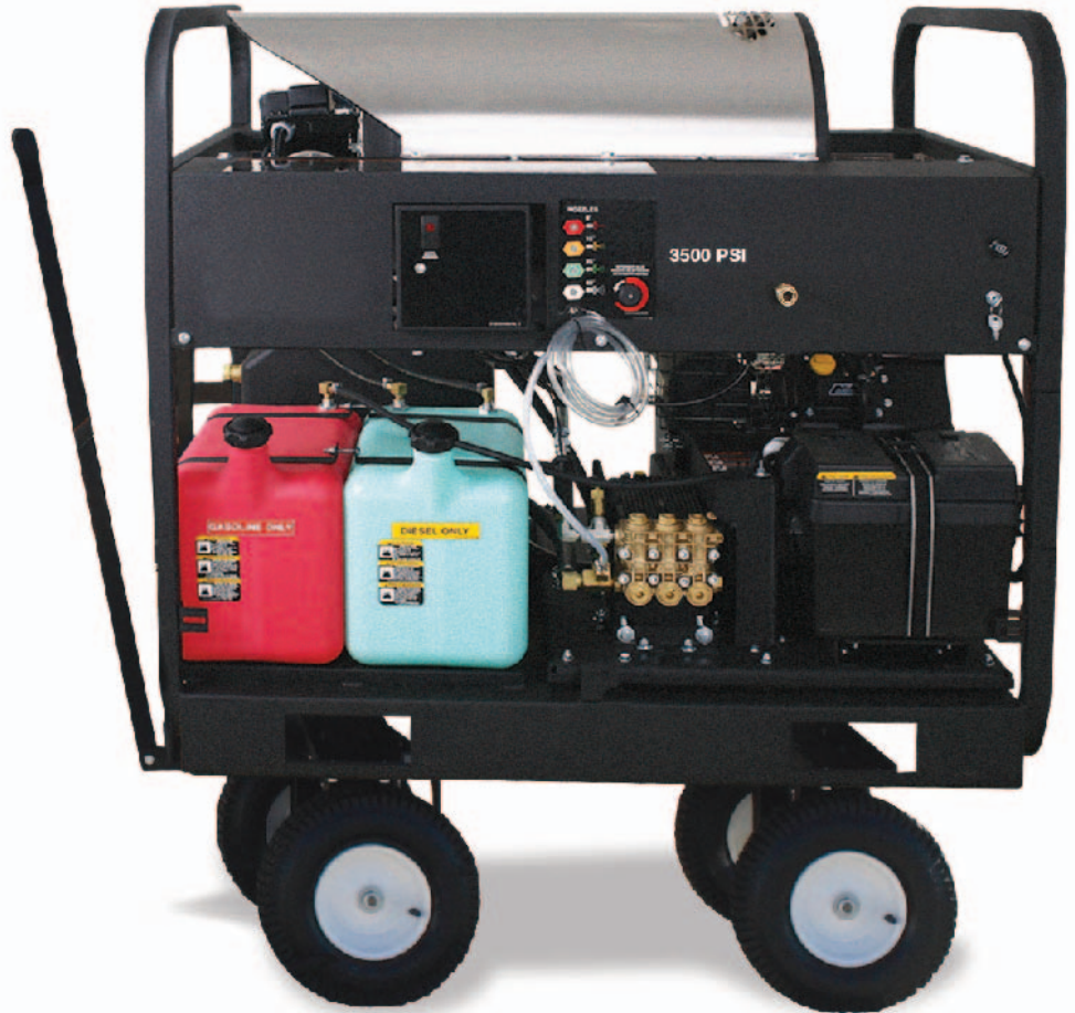
HDC-3505-0K6G shown with optional wheel kit

Large polyethylene float tank prevents rusting