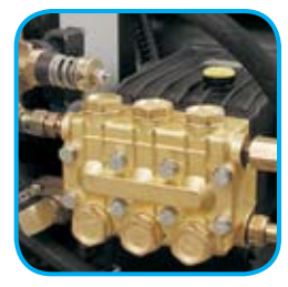
Pump accepts incoming water up to 175°F